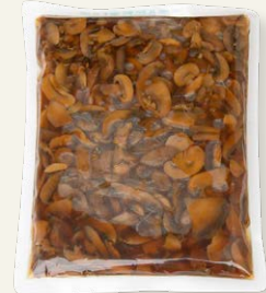
5/32oz Garlic Marinated Sliced Item # 81104 Product of Mexico