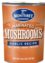
3/#10 Garlic Marinated Whole Mushrooms Item # 64813 Product of Mexico

Our garlic and teriyaki marinated mushrooms are made with tried and true recipes we've been using for decades. These timeless flavors, Garlic and Teriyaki, are family favorites.